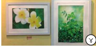
Mithila Yain Exhibition