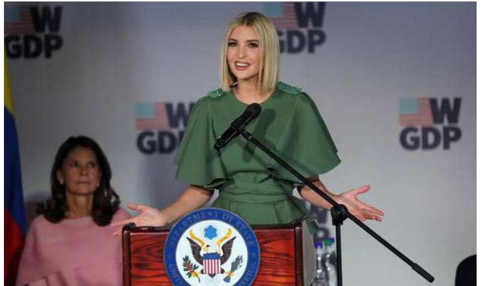
U.S. President Donald Trump's daughter Ivanka Trump, a senior White House adviser, speaks during an event in the United States Embassy in Bogota, Colombia September 3, 2019.