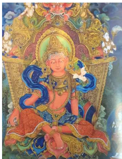
Art by Sujit Maharjan displayed in an event called Kholo, held at the Woodcraft Gallery, Thamel on September 7, 2019.

Kholo is a month-long art exhibition organized by the Woodcraft Gallery. This exhibition is being hosted by Tilicho Kala and began on September 7, 2019.