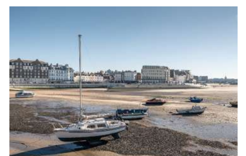
One of the images from Place, Space and Who by Barbara Walker.

"That little white space represents a lot," adds Walker, speaking about the gallery. "I wanted to disrupt it. And I am."