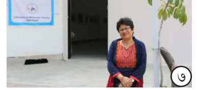
Artist of the week