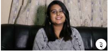
Entrepreneur of the week

वर्ष-१३ अङ्क-४३ २०७६ भाद्र २४ मङ्गलबार 10, September, 2019 ने.सं. ११३९ पूर्णाङ्क ५३६ रु. २५१-